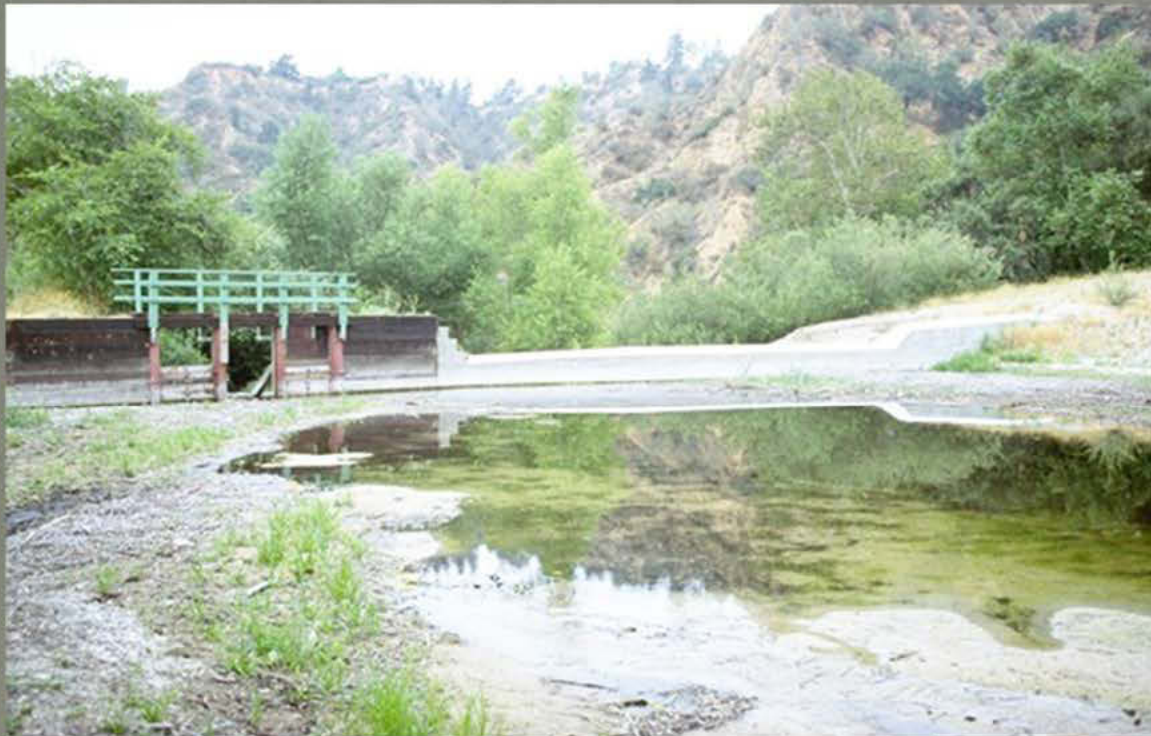
Spillway at Headworks Facility