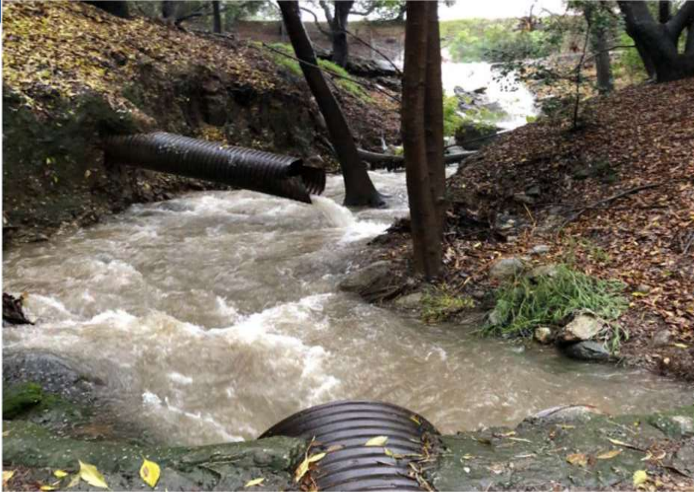
Existing Channel Conditions