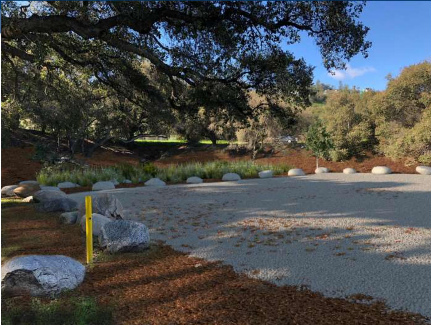
Equestrian Picnic Area Looking Southwest