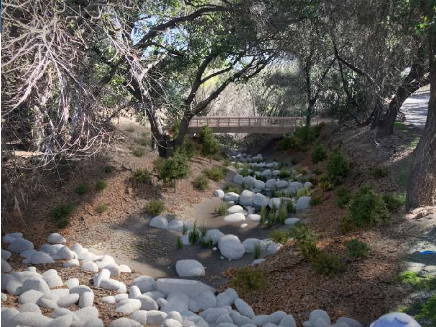
Bridge Crossing Looking East (Downstream)