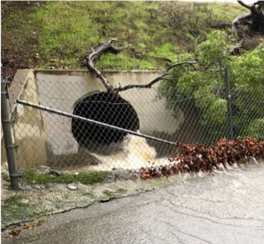
Existing 60" Outfall