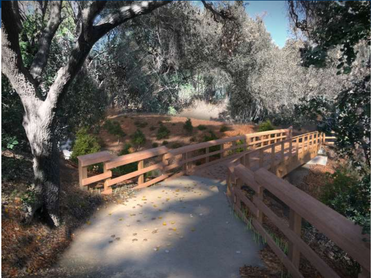
Bridge Crossing Looking Northwest