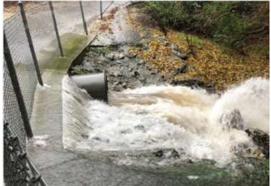
Existing 30" Crossroad Culvert