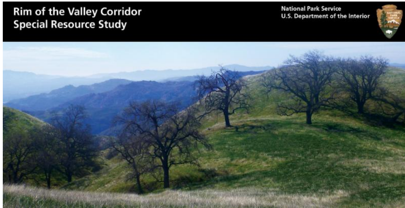
Oat Mountain area in the Santa Susana Mountains.

Having trouble viewing this email? Click here