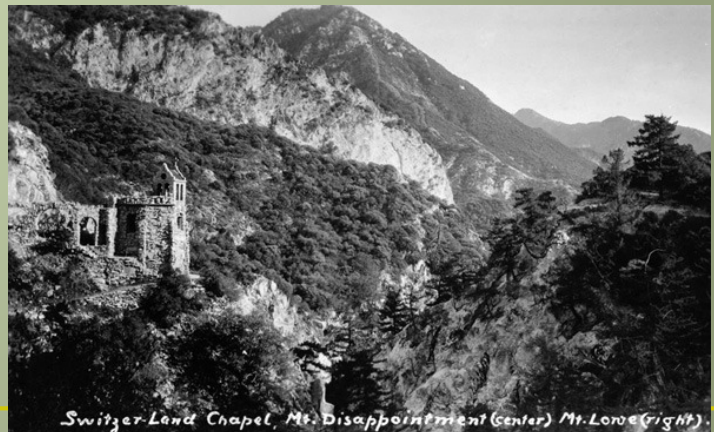
Switzer-Land Chapel, Mt. Disappointment (center) Mt. Lowe (right).